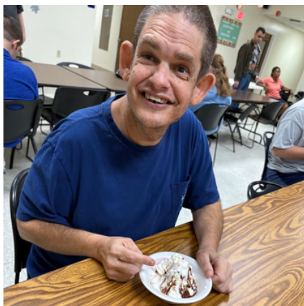
Ice Cream Social & Dance Party